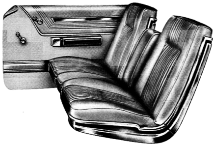
Newport all-vinyl Bucket Seats (optional on 2-dr. H.T. only)

All-vinyl trim , with front-seat folding center armrest, is standard on the Newport convertible.