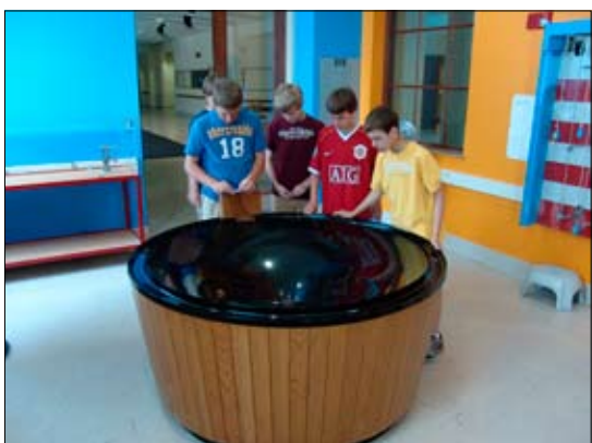
Students peering into black hole.