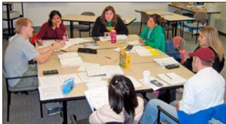
A small study group in the Physics Learning Center.

The Physics Learning Center provides small-group academic support for students studying introductory algebra-based (Physics 103–104) and calculus-based physics (Physics 207–208) sequences. These courses are gateway courses taken by students majoring in the biological sciences, physical sciences, pre-health professions, pre-secondary science education, and engineering. We expanded our program in spring 2007 to include students from both semesters of Physics 103–104 and Physics 207–208. The Physics 207–208 sequences have been the focus of curriculum development. The Physics Department, in collaboration with campus biology faculty and the staff from the Center