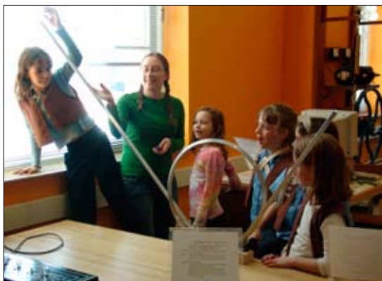
Brownie troop does the loop-the-loop.