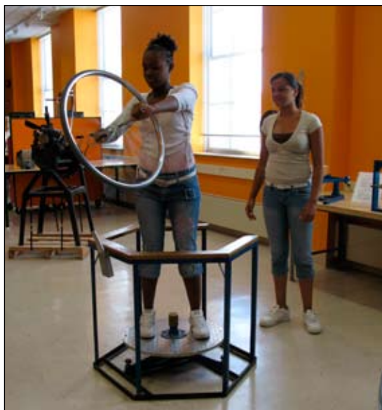
Students taking the spinning table for a spin.

For tours of the museum, contact Steve Narf, 608/262-3898 srnarf@wisc.edu