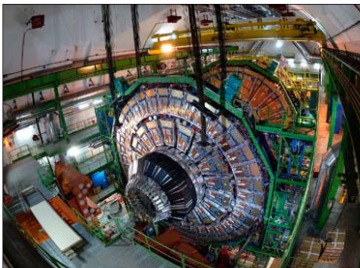
Lowering of the CMS endcap disk, designed and equipped by the University of Wisconsin for the CERN LHC.

UW faculty, scientists, postdocs, and engineers have made major contributions and played leading roles in the ATLAS and CMS detectors that will observe the collisions of the LHC proton beams. Both ATLAS and CMS groups have been training Wisconsin graduate students in preparation for theses on the LHC discovery physics.