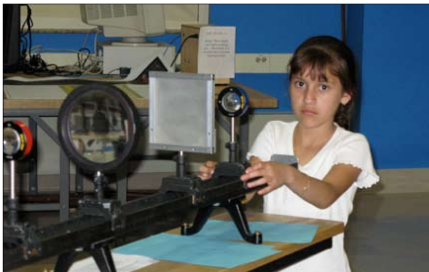
Student, not left in peace to find focal length of lens.