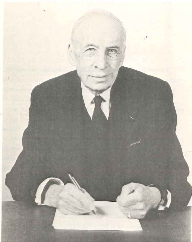
Professor John Hasbrouck Van Vleck Hollis Professor of Mathematics and Natural Philosophy, Emeritus Harvard University